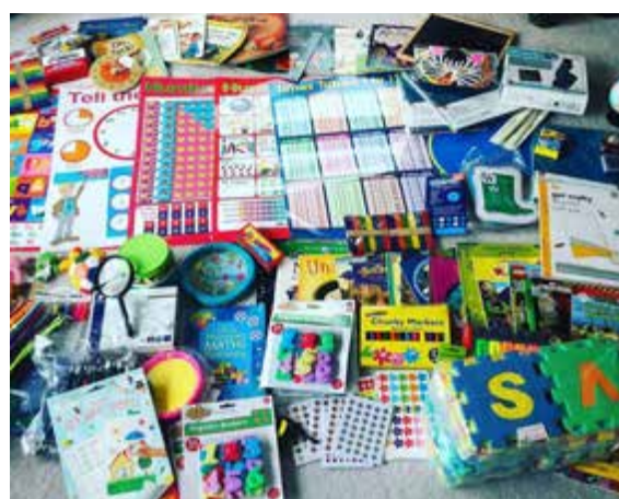
Some of the resource packs contents donated and distributed