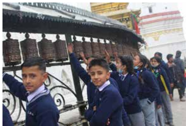
School Trip to Kathmandu pre-COVID