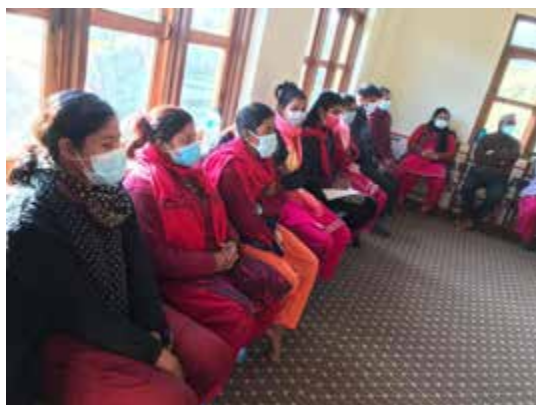
Parents meeting November 2020 as schools returned briefly