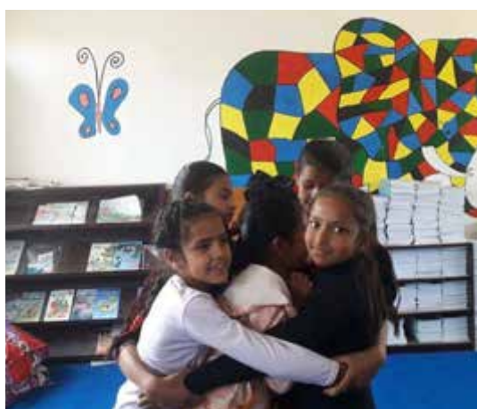
AoE games in the days before COVID