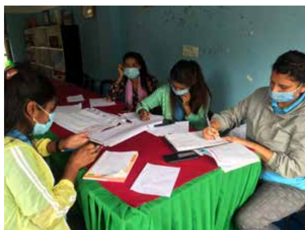
The first teacher planning meeting to take place post COVID-19 in Kushadevi