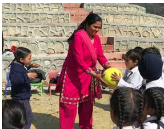
Outreach PE lessons with Classes 3 and 4