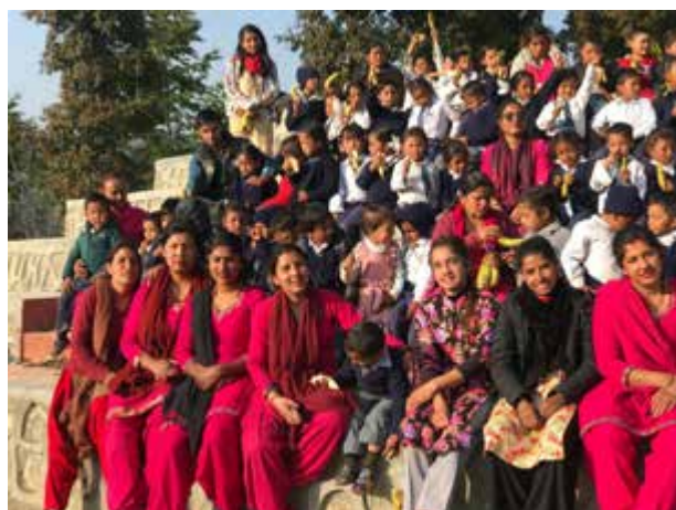
MSP school trip with our 9 teachers, TAs and 62 children - and healthy snacks!