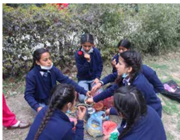
AoE snack time while planning the Balachandra School AoE event