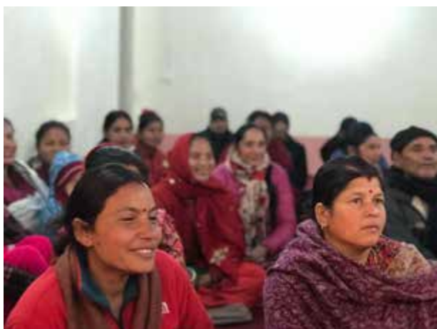
Outreach meetings with Mothers at Rayale which included an interactive workshop on child safeguarding and nutrition